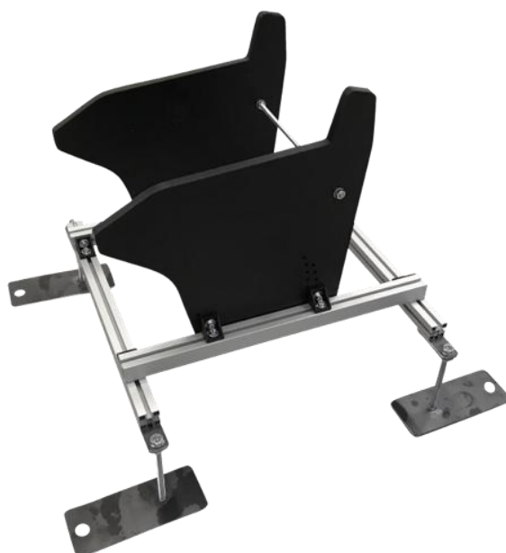
Picture 7 Starting block

© (2023) Copyright by UIM - Union Internationale Motonautique. All rights reserved. No part of this document/publication may be reproduced, distributed, or transmitted in any form or by any means without the prior written consent of the UIM, except for the non-commercial use within the scope of authority of the UIM and its affiliated members.