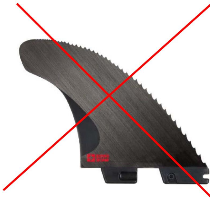
Picture 6 - Side fin toothed shapes